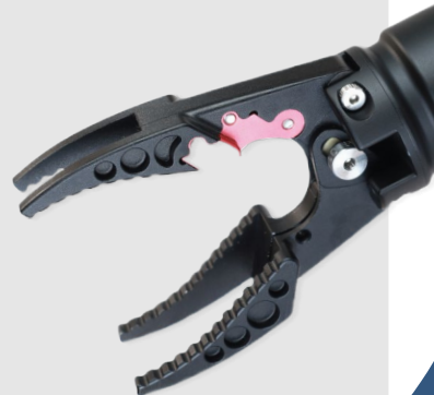
Quad Jaws ▶ (P/N RA-1017)

Four interlocking prongs provide additional stability. Increased grabbing surface area.