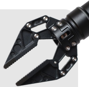
Parallel Jaws ▶ (P/N RA-1012)

A pair of flat plates closing in parallel, providing predictable grip location. Suitable for manipulation tasks requiring consistency such as valve actuation.