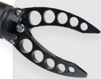
◀ Standard Jaws (P/N RA-1014)

Tough and reliable jaws for grabbing applications. Suitable for small access areas and where extra reach is required.