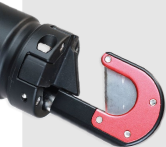
◀ Rope Cutter (P/N RA-1031)

A capable rope cutter for severing tangled lines and recovery operations. Suitable for Dyneema, Nylon, Heshan rope.